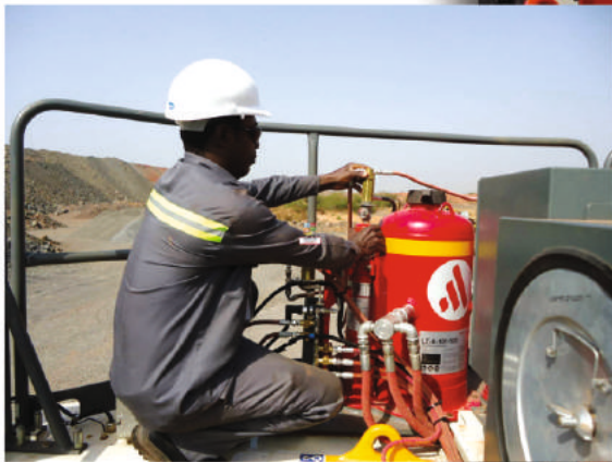
An Engineer Working on a Fire Suppression System